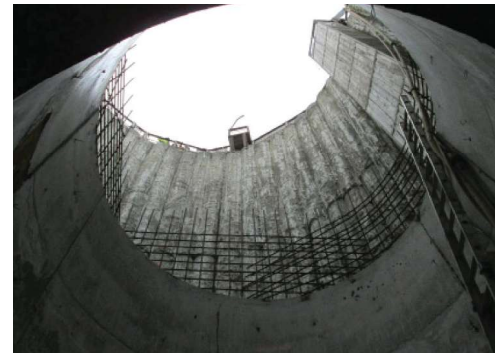
AquaShield alleviates the need for a surface applied waterproofing system.

AquaShield is an integral crystalline concrete waterproofing mixture. It turns your concrete mass into a waterproof barrier. Used in place of externally applied surface membranes, AquaShield protects against moisture transmission, chemical attack, the corrosion of reinforcing steel, a variety of other structural benefits and cost savings that make it a superior product in its class.