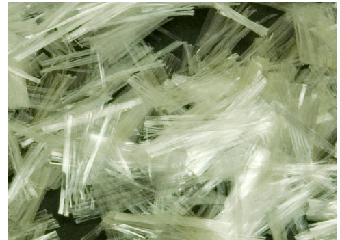
FiberMaxFI fibers can be an alternative to wire mesh for many flatwork projects.

One of the main challenges of concrete construction is controlling shrinkage cracking both at the early stage (plastic shrinkage) as well as during the settlement stage (drying and temperature shrinkage). Steel reinforcement in the form of welded wire mesh and rebar does not prevent or minimize cracking—it simply works along a two-dimensional plane to hold together cracks that have already occurred. Reinforcing fibers are distributed in three dimensions throughout the mix offering support for the coarse aggregates. This minimizes segregation that can lead to excessive bleeding, surface defects and curling.