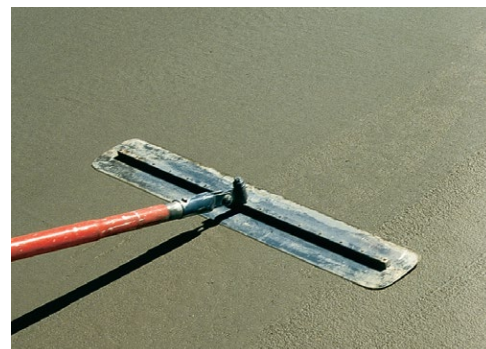
Smoother more durable finish.

EasyFlow ready-mixed concrete dramatically improves workability and finish for all your concrete needs. EasyFlow is less sticky and flows more readily to provide greater all-round productivity.